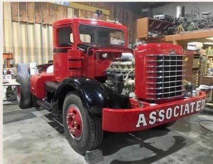
Sturgis Hauling and Restoration After