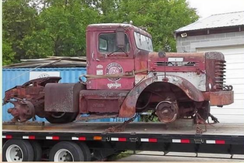
Sturgis Hauling and Restoration Before