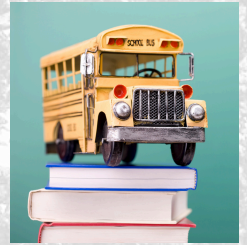
Back to School Image

As our kids head back to the classroom, please be extra cautious on the roads. Watch out for school buses, bikers and walkers. Slow down in school zones and help us keep our community safe! Here's to a fantastic school year ahead!