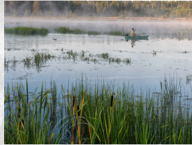
Pic of Wetlands

Conservation commissions are the local municipal environmental agencies in Massachusetts. They are responsible for protecting the land, water, and biological resources of their communities and Southborough needs you! Please apply today to become a Conservation Commission volunteer member to oversee open space and wetlands protection. No experience necessary - just a willingness to learn and be involved. The Commission usually meets once a month on Thursdays. Click here to apply: https://shorturl.at/frL3A