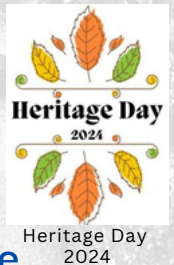
Heritage Day 2024

Join the celebration as Southborough celebrates Heritage Day on Monday, October 14, 2024 at St. Mark's Field (Rt. 30 and Rt. 85 intersection). Booths are available for crafters, artisans, non-profit organizations, food trucks and local businesses. Hours are 10 AM - 2 PM- rain or shine. There are no refunds and space provided is about 10' X 10'. Please bring your own tent, tables and chairs. Please note, all booths must be weighted down with proper weights. Set up opens the morning of October 14th at 7:30 a.m. Your booth location will be communicated upon check-in the day of the event. The deadline to apply is September 30, 2024 and you can do so here: https://shorturl.at/cYnpK