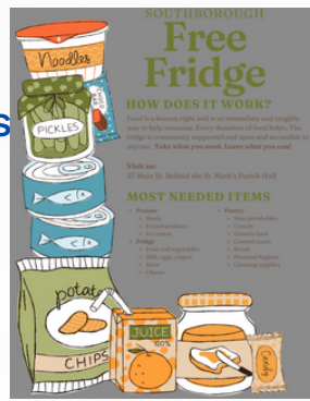
Free Fridge Flyer

The Health Department coordinated with the community and St. Mark's Church for planning, permitting and opening of the Community Free Fridge in 2023. This resource is available to all and is located behind St. Mark Church's Parish Hall at 27 Main Street. They say, "Take what you need and leave what you can."