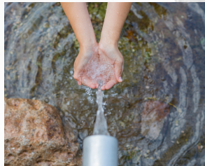
Pic of water pipe

On March 4th, the Select Board heard from the Town's water consultant and DPW Superintendent about the impending recommendations for FY25 water rates. Due to the exceedingly wet summer last year, and the lower than expected sale of water, water rates will need to increase for the coming year in order to meet anticipated expenses. Remember, because water is an enterprise fund, the expenses need to be covered in full by the revenues generated through the rates. The Board will be meeting on March 19 to review and approve the recommendations of the water consultant for the new water rates. As always, residents can participate in the discussion in-person or remotely via Zoom.